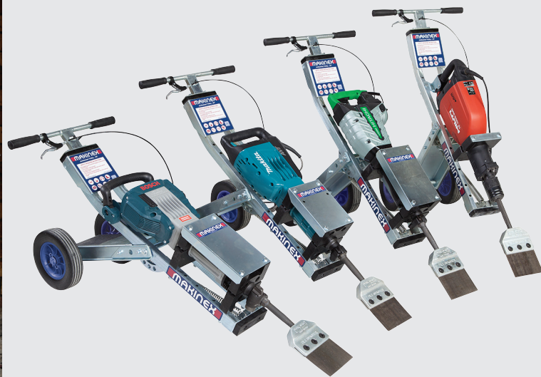
The JHT suits most 16kg jackhammers.

// I am able to complete jobs faster, which allows me to bid and win more jobs. //